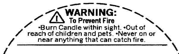
FIG. 2 Example Label

shall be 10 % of the product display space of the panel on which it is displayed (that is, top or bottom or sides), but in no case be smaller than specified in 5.2.1 nor larger than 3 cm (1.2 in.) high.